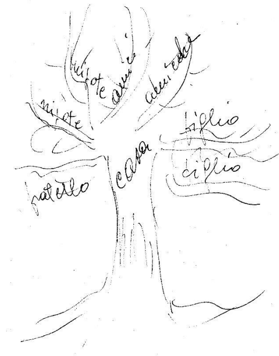
Figure 2. Relational map of Luisa's family.

Although the idea of the family home provided a material and moral base to this 'root', it could also be ascribed to a broader category of family assets over which the individual had very little, if any, influence. Carla, for example, a 58 year-old psychologist who inherited a detached house from her parents (and they in turn from their parents) in a prestigious central neighbourhood, while aware of her privilege, also expressed other contrasted feelings: