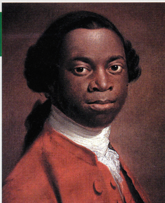
Olaudah Equiano: slave, freeman and author of Equiano's Travels

Extracts can be read on www.brycchancarey.com/equiano