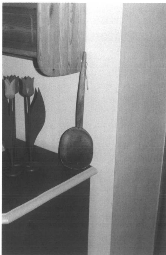
Fig 1. Wooden spoon. According to the author's informant, this is an original antique purchased in a local auction