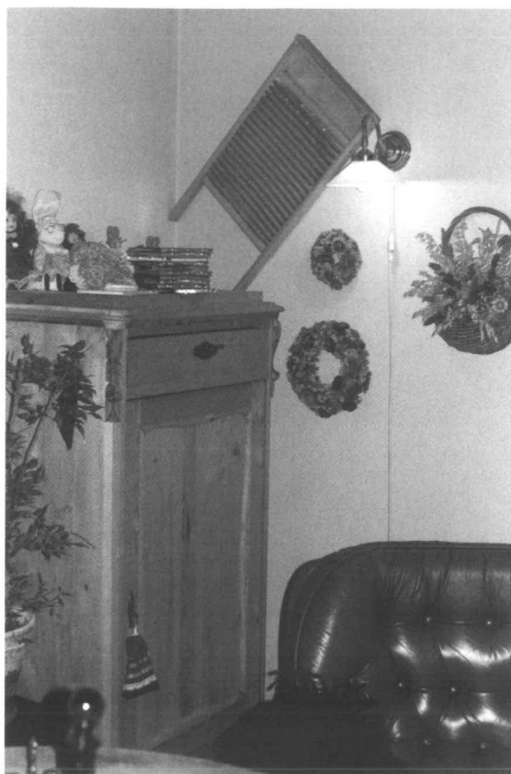
Fig 2. Washing board, part of an 'old style' decorative theme

appeared in auctions from time to time. Since the 1960s, peasant artefacts such as old tools or household utensils have been fashionable as domestic ornaments in Norwegian homes. 19 In Skien, Tine's decorative tastes are not unique as antiques and contemporary copies of originals are widely popular as ornamental pieces. Traditional artefacts used as decorative household goods include items such as antique sewing machines, spinning wheels, weaving paraphernalia, washing boards, wheels, tables, buckets and carved wooden chairs [1–2].