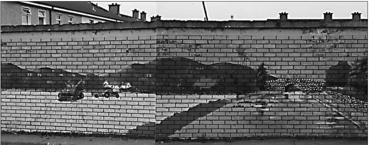
Figure 3. A mural depicting a harvest scene.

joyous with the sounds of industry, the romping of sturdy children, the contests of athletic youths, the laughter of comely maidens; whose firesides would be the forums of the wisdom of serene old men. [ Irish Press , 18 March 1943:1]