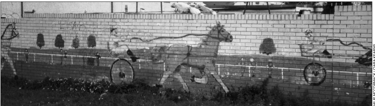
Figure 4. A mural in Cherry Orchard depicting horses racing in harness.