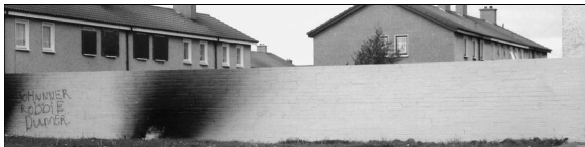
PHILIP MCCORMACK / CIARA KEARNS