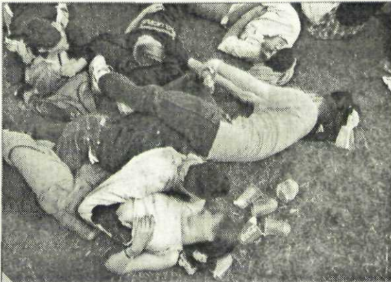
Age of innocence: young boys at the St. Mary's school in Dublin.

T HERE is a storm but largely unheeded at least until now to capture the views and minds of Irish society. It is about sex and sex education, but what the changing nature of both these are was not of necessity an issue for or on the face of the world's attention. On the one side are the traditional Catholics, not so united in homogeneity as a group as is sometimes supposed, who are largely about the new education about sexuality and reproductive health introduced in schools. They want to prohibit their children from receiving the kind of education or information as to sex and reproduction, and have a vested opinion on the appropriate role of reproductive health in the curriculum and in sexual education. On the other side are the liberals, who are not so united in homogeneity, a group as is sometimes supposed, who want to bring to an end the role of reproductive health in the curriculum and in sexual education. They want to prohibit their children from receiving the kind of education or information as to sex and reproduction, and have a vested opinion on the appropriate role of reproductive health in the curriculum and in sexual education.