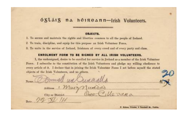
Ua Buachalla's Irish Volunteers enrolment form 1914 PP26/2/1/1(19)

Documents of note include enrolment forms for members of the Irish Volunteers in Maynooth from November 1914 (PP26/2/1/1), notice of order of interment issued to Ua Buachalla in 1916 (PP26/2/1/3) and a letter from Countess Markievicz, T.D. regarding farmers in Maynooth allowing land to go fallow (26 February 1920) (PP26/2/3/4).