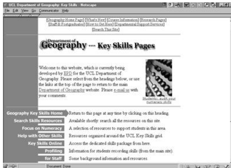
Figure 2: the Geography Key Skills Homepage

For this department, the format and structure of the customized pages was discussed with academic tutors and an academic administrator. The pages were then designed in their departmental 'house' style but they were stored with the key skills website during the pilot phase. Figure 2 shows the customized key skills home page for Geography, and Figure 3 the key skills homepage which conforms to the central UCL web design.