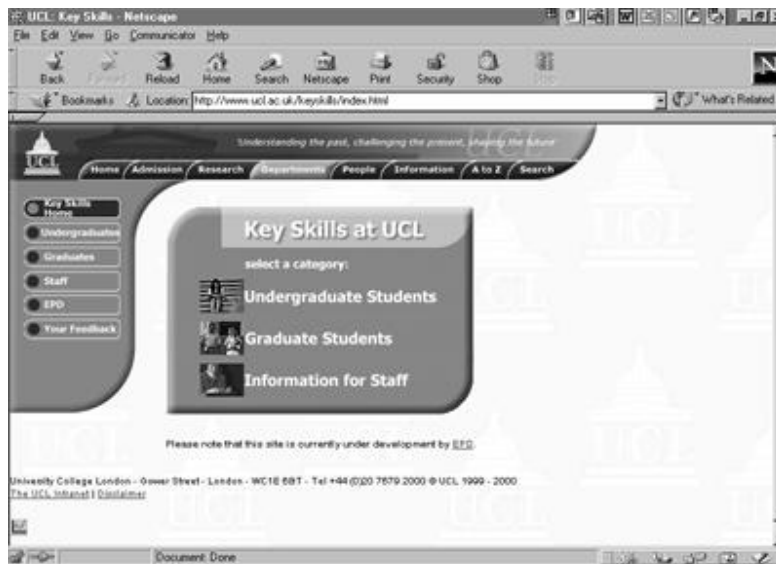
Figure 3: the main Key Skills Homepage

Mentioned previously was the idea that the customized pages could be used by departments to prioritize particular skills at particular times. In this case, the department wished to focus on numeracy skills for one of their undergraduate courses. They felt that resources which would help students to revise some of their skills, and then lead into more complex skills such as data analysis, would be of help in supporting this course. The selection of appropriate resources to be included depended on discussion about what ‘numeracy’ meant for these course and these students. The links included quality generic resources as well as the staff homepages of the course coordinator, and a range of material he had gathered or noted, but had not previously been able to present to the students in the context of supporting their coursework.