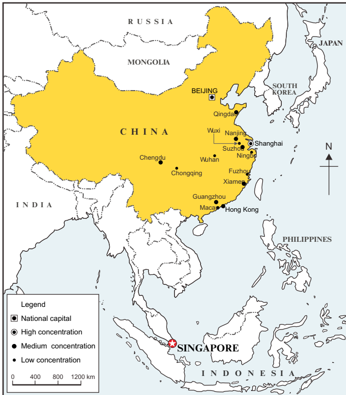
Figure 2. Geographical concentration of Chinese cities with overseas Singaporean clubs as listed on the OSU website.