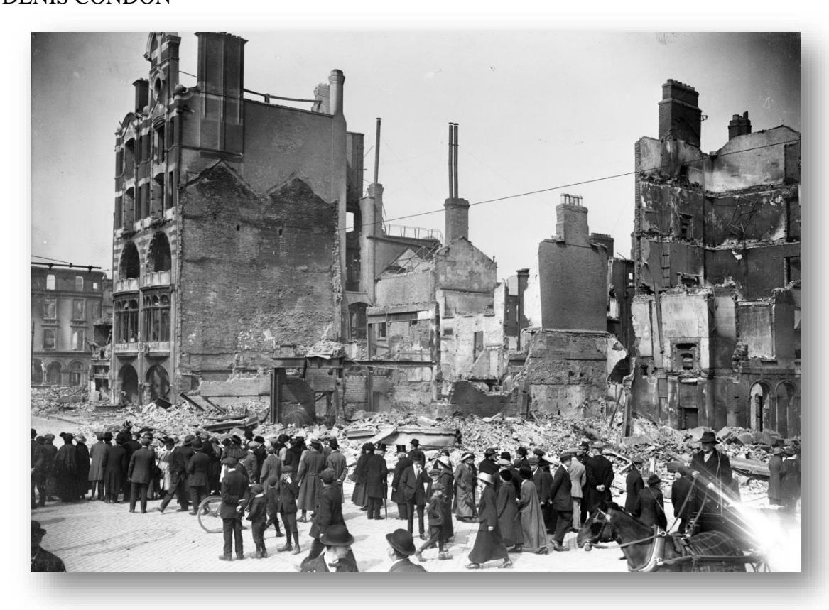
Dubliners view the ruins at the southeast corner of Lower O'Connell Street after the Rising. The large building on the left of the image is the DBC (Dublin Bread Company tearooms) and to the left of it are the remains of the Grand Cinema.