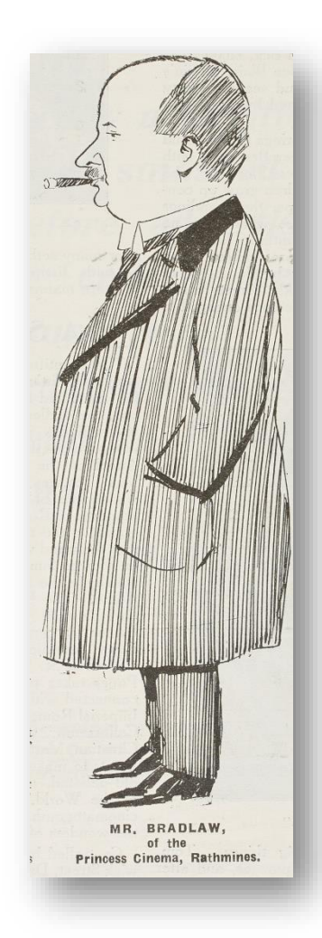
Caricature of I.I. Bradlaw, Irish Limelight, February 1918, p. 1.