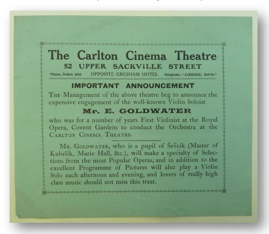
Handbill announcing the Carlton's engagement of Erwin Goldwater, March 1916.

patrons to travel either out of the city or across it. The Bohemian was not alone in attracting patrons with its musical attractions; this was a further part of the development of cinema from a cheap, accessible, working-class entertainment into a respectable middle-class one. Although it is not recorded what the Bohemian musicians played, the audience would have watched the filmed ruins of their city while listening to skilfully rendered classical music.