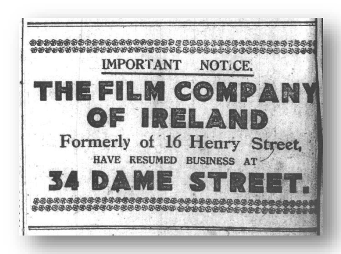
Destruction of their offices in Henry Street forced the Film Company of Ireland to relocate to Dame Street. Dublin Evening Mail , 12 May 1916, p. 7.