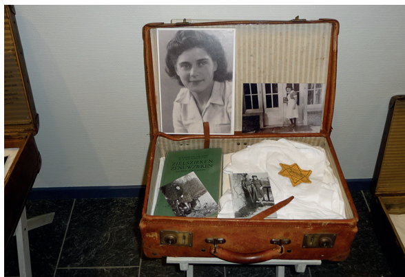
Photo 1: The stories of Jewish inmates in Westerbork Memorial Center

The exhibition space includes suitcases, family photos, reproduced and some original postcards and letters, and other small personal items (Photo 1). The politics of artefact representation (ALDERMAN and CAMPBELL 2008, 345) are used to depict an embodied experience of what a transit camp might have looked like for the visitors. The visitor can move around this space in whatever direction s/he chooses and examine the objects on display; the amount of information is not overwhelming and there are spaces to take a break (and to sit down). Despite the seriousness of the topic, one does not often see visitors in the exhibition space crying or distressed; we believe that this may be related to the design of the exhibition space which is open overhead and does not have sections with dark lighting. Moreover, the content of the exhibition is appropriate for children, young people and adults, which means that no visual images of bodily violence or death are depicted. Toward the end of the main room, the visitor wanders “into” an “original” (reconstructed, partially built) barracks; after going “through a door” into this space