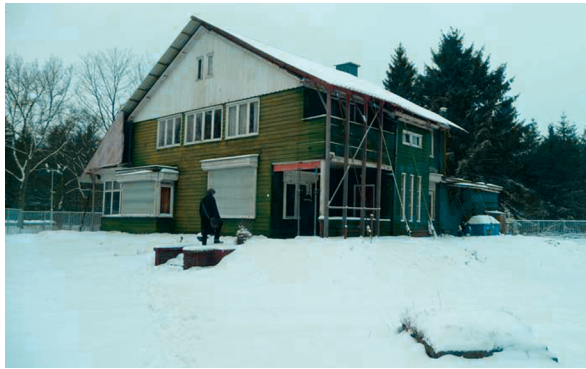
Photo 6: The old Commandant's house in camp Westerbork (Photo: KUUSISTO-ARPONEN January 2013)

that the wooden villa of the camp commander has remained standing, whereas a fire in Veendam in 2009 destroyed the barracks in which Anne dismantled batteries. 'It is a cruel twist of history that the residence of the camp commander still stands', the website of the Westerbork Camp states. It is, however, not history but human actions and failures that are responsible for this' (JANSEN 2015, 201). A form of commemorative competition has also emerged on the terrain. As if to reclaim the significance of the voices of those who suffered during the war, on the occasion of the 70 th anniversary of Westerbork's liberation, a new "speaking memorial", Voice Names , was launched in Spring 2015 (Dutch Online News 2015; RTV Drenthe 2015). This sound installation includes the names of former prisoners (Jews, Sinti and Roma, and resistance fighters) and selections from the diary of camp-prisoner Philip Mechanicus within two restored original train cars that regularly departed Westerbork to go to extermination camps during 1942–1944. Located on a piece of rail on "The Ramp" this sound sonic memorial adds a new aesthetic element to the original memorial complex that claims its authenticity through artefact, historic location, and Holocaust memorial iconography.