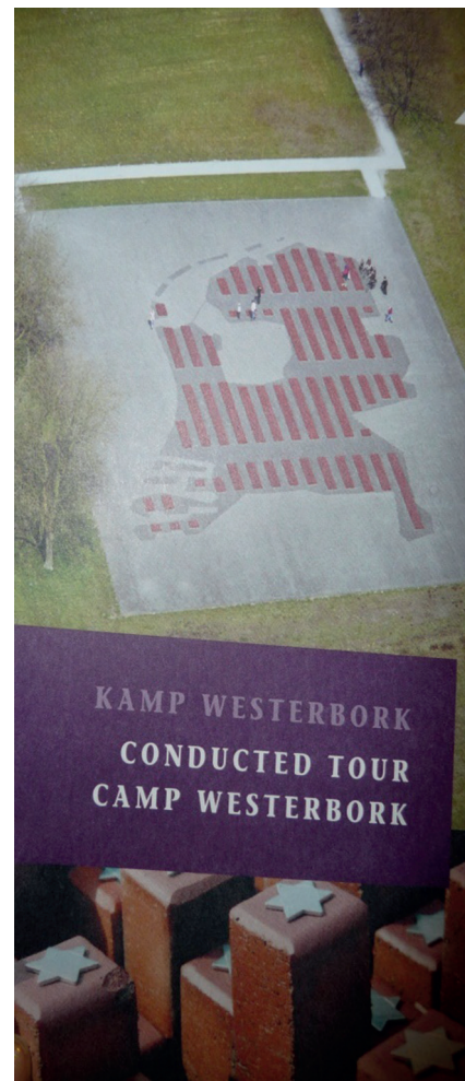
Photo 4: Cover page of the Westerbork brochure picturing the open-air monument at the camp-site. Red brick tiles are in the form of barracks and the entire constellation depicts the Netherlands map: national territory

In addition, the “Jerusalem Stone” was given as a gift in 1993 from Israeli President Chaim Herzog, in the presence of Dutch Queen Beatrix “in memory of the victims of Nazi terror and Westerbork”; “similar stones were also placed in Auschwitz and Bergen Belsen” (KAMPWESTERBORK). In 2001, a series of commemorative plaques designed by Victor Levie were unveiled near the entrance to the former camp by Jules Schelvis, one of eighteen Dutch survivors of the Sobibor, and former Prime Minister Wim Kok. Each plaque lists the destinations of extermination camps Westerbork inmates were sent to – Sobibor, Mauthausen, Bergen-Belsen, Auschwitz and Theresienstadt – as well as shows the numbers of deportees and victims ( ibid ). Other subtle signs and well-known Holocaust symbols are to be found in Camp Westerbork, perhaps to convince the visitor that real people with their families were once here before being transported to their death. A series of much less than life-size concrete barrack markers are located on the historic sites, mostly covered with mounds of snow in winter (Photo 2). Along the pathway, glass plaques are irregularly scattered throughout the empty camp scenery with (we assume reproductions of original) letters and