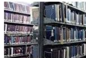
COMMUNICATION & OUTREACH