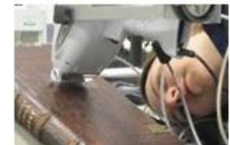
UNIQUE AND DISTINCT COLLECTIONS GROUP