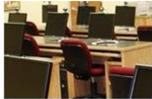
TEACHING AND LEARNING