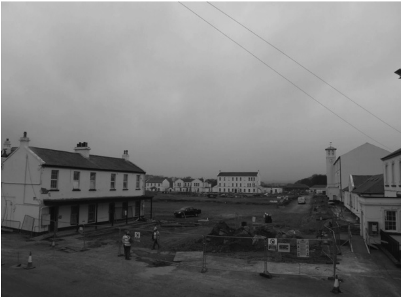
Figure 5: The former Ebrington Barracks parade ground undergoing transformation into a multi-purpose public space. Photo taken in 2011.