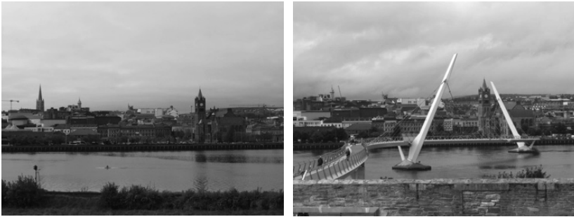
Figure 4: The view from Ebrington Barracks towards the Guildhall, before and after the construction of the Peace Bridge. Photos taken in 2008 and 2013.