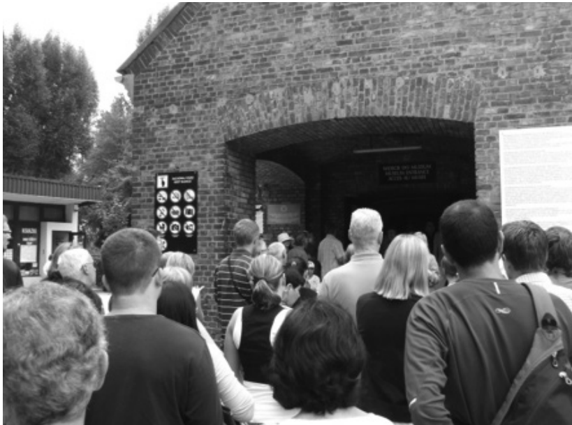
Figure 1: Tourists gathering at the entrance to the Auschwitz I concentration camp, a UNESCO World Heritage Site since 1979. Photo taken in 2009.