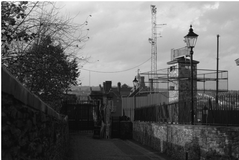
Figure 3: The Troubles-era fortifications and surveillance apparatus (since removed) surrounding the Verbal Arts Centre on the historic city walls. Photo taken in 2005.