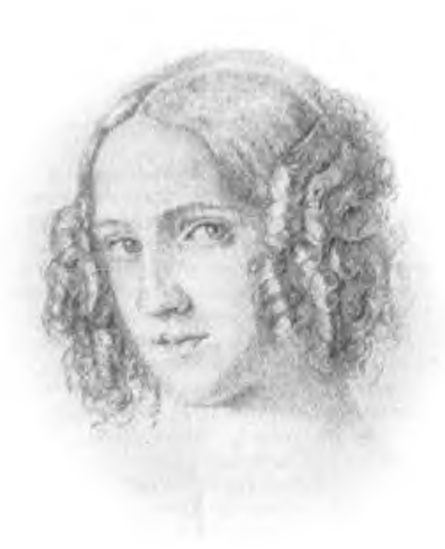
Figure 1. Josephine Lang

as it echoes the rising figure of the piano introduction. The ability to get lost in the moment is delineated commendably in Lang's musical treatment of the text culminating in the third exultant declaration 'Sie liebt mich!', arriving at the dominant first inversion at bar 12.