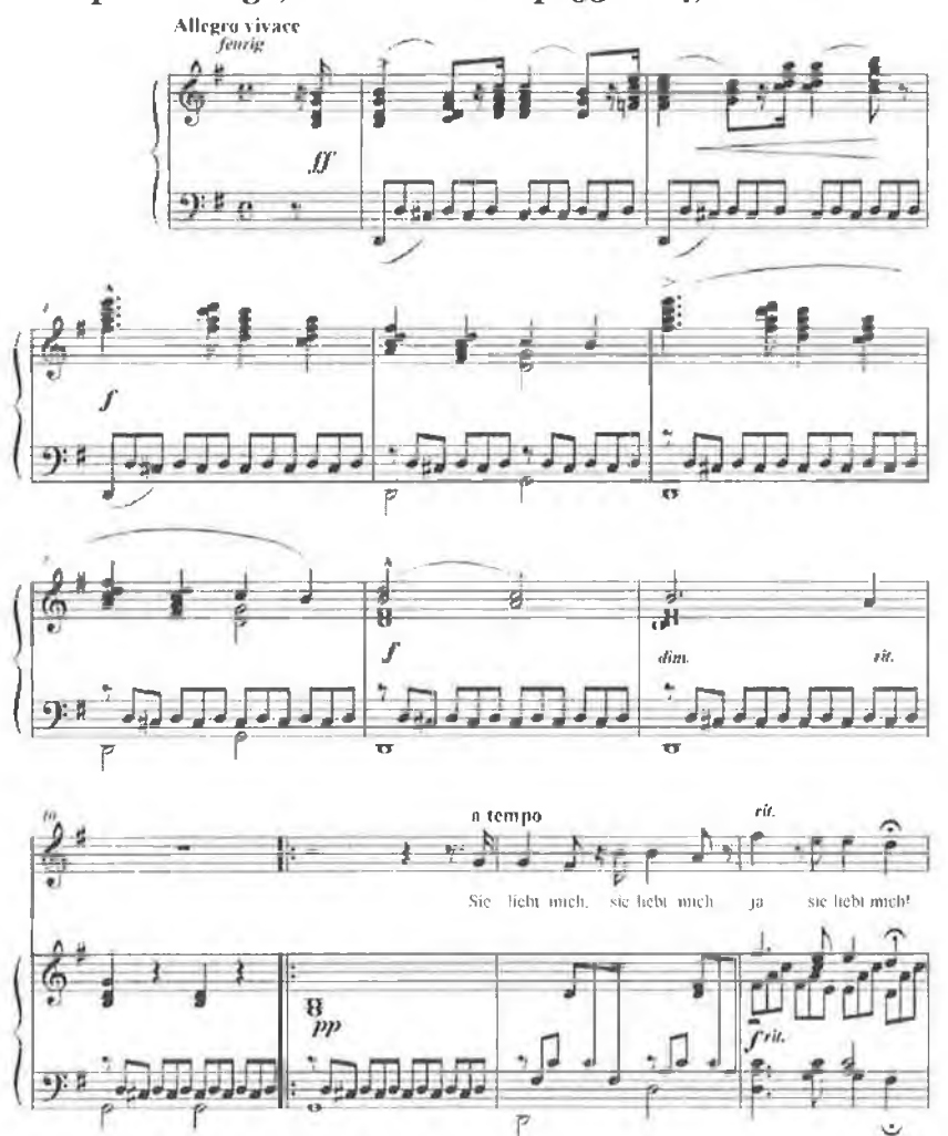
Example 6. Lang: ,Sie liebt mich' op. 33 no. 4, bars 1–12

The absence of a perfect cadence musically illustrates the protagonist getting 'carried away' with his/her thoughts. The piano takes over with a descending scale-like figuration, as if when the voice goes silent the piano becomes more vocal: such interplay amplifies the questioning in the poem, 'am I myself, am I alive?' while also exemplifying the interdependent roles of piano and voice prevalent in Lang's Lieder. A climax culminating in the jubilant high 'A' on the repetition of 'Sie liebt