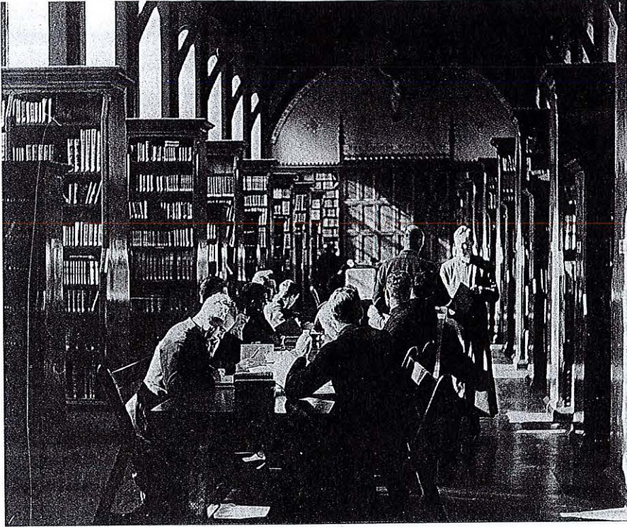
The library in the 1940s.