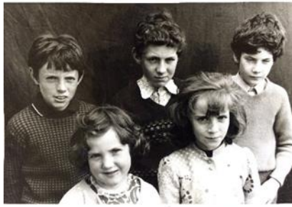
lay. Photo1 school photo

Old family photos remind me of the happiness of my childhood and strange to look now at the innocence of the child in photos, knowing the personalities and vulnerabilities of each. How unknown the world ahead