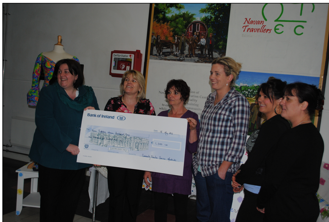
Image 1.4 N.T.W.D.G. Receiving a Cheque from Community Education

They were on a voyage of discovery and they didn't want to get off as they hadn't yet reached their destination.