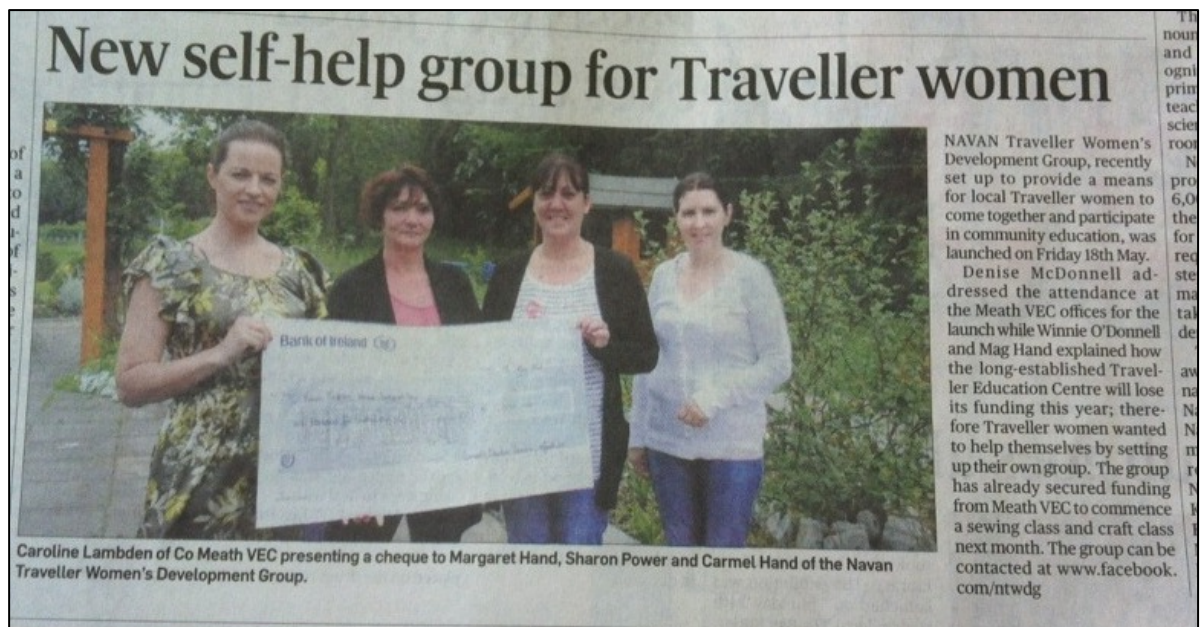
Image 1.2 Launch of the NTWDG – Courtesy of Meath Chronicle May 2012.

October 2012: Adult Literacy and NTWDG run a six-week 'Family Literacy' course. NTWDG also submit and funding application to The Women's Fund to run a program of craft and sewing courses from January 2013.